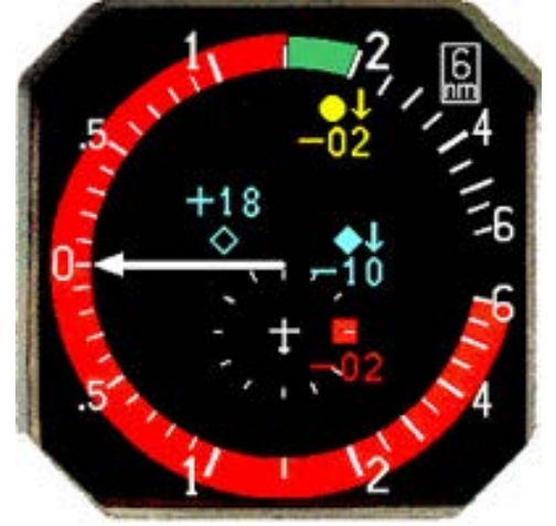
Generic TCAS Display

So how does TCAS work? Rather than take up the rest of this magazine with the subject, I'll just cover the basics. The first important fact to know is that TCAS operates independently of any ground equipment; it is a cooperative system that uses SSR transponders to gather and derive information such as bearing, location, altitude, slant-range and closure rate. Using this information, it then applies anti-collision logic to calculate alerts based on timeto-go to the predicted Closest Point of Approach (CPA) between the aircraft (known as tau). TAs and RAs are triggered at defined tau values which, in effect, provide protected volumes around the aircraft. But it's important to know that TAs and RAs may be inhibited by the system logic; for example,