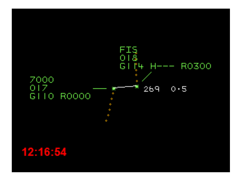
Figure 1 - 12:16:54

Both aircraft were operating outside controlled airspace and proceeded to fly into proximity approximately 7nm south-east of Peterborough airfield. The FISO did not pass any traffic information on the PA28 to the pilot of the P68.