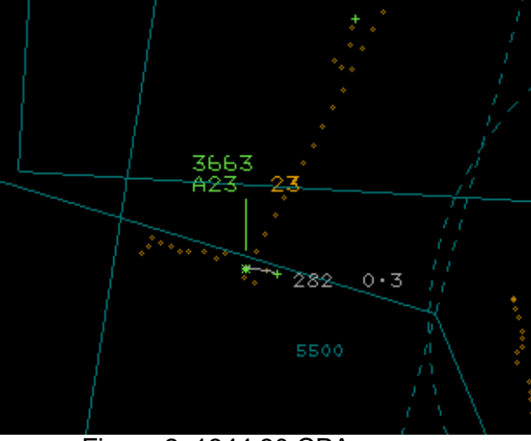
Figure 1: 1344:26