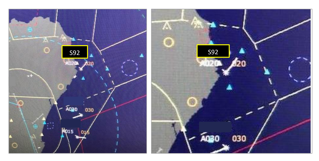
Figure 2 Figure 3

At 1409:59 the PSR return re-appeared on the Allanshill display, as shown in Figure 2. Again, nothing was seen on the Perwinnes radar display, as shown in Figure 3; both screenshots were taken at the same time.