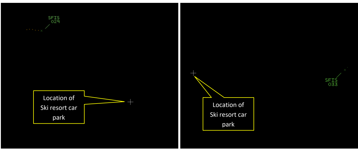
Figure 1. 1816:36 – C152 disappears from radar.

An analysis of the NATS radar replay was undertaken. The C152 was observed on radar until 1816:36 at which point it disappeared (Figure 1). It reappeared at 1822:30 in a position approximately 7.8NM away (Figure 2). The groundspeed of the C152 recorded on the radar was ~83kts meaning the maximum distance it could have flown in that time is 8.3NM, therefore, it is likely that it did not follow a direct routing between these points. The paraglider pilot supplied the UKAB Secretariat with a GPS log file from which their area of operation has been extracted, as shown in the diagram. As the C152 pilot's routing between the recorded radar returns was unlikely to have been direct, this could have allowed them to pass near to, or through, the northern part of the area of operation of the paraglider.