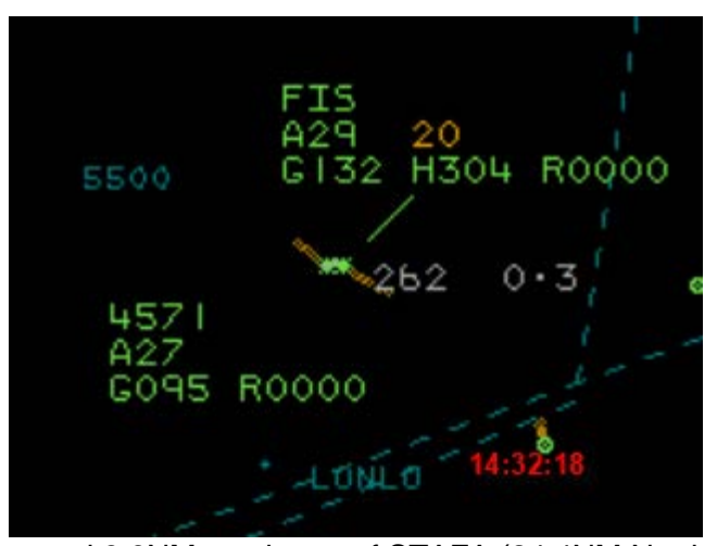
Figure 1:CPA occurred 9.6NM southeast of STAFA (24.4NM North of Birmingham).

At 14:32:18 the two aircraft passed each other with a closest point of approach of 0.3NM and 200ft.